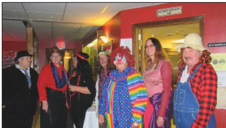
Welcoming committee at the VFW Post 6774.