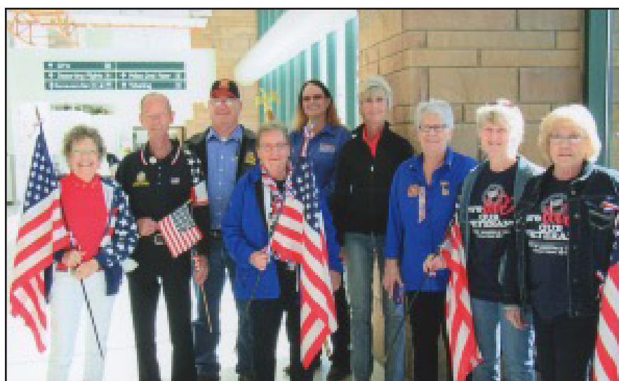
VFW and Auxiliary members waiting at the airport for National President to arrive.