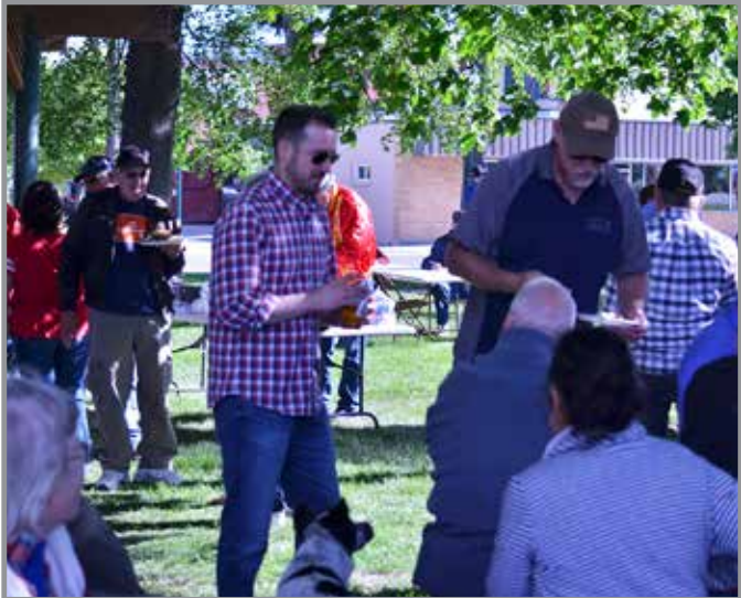
Sr. Vice Commander & President's Picnic