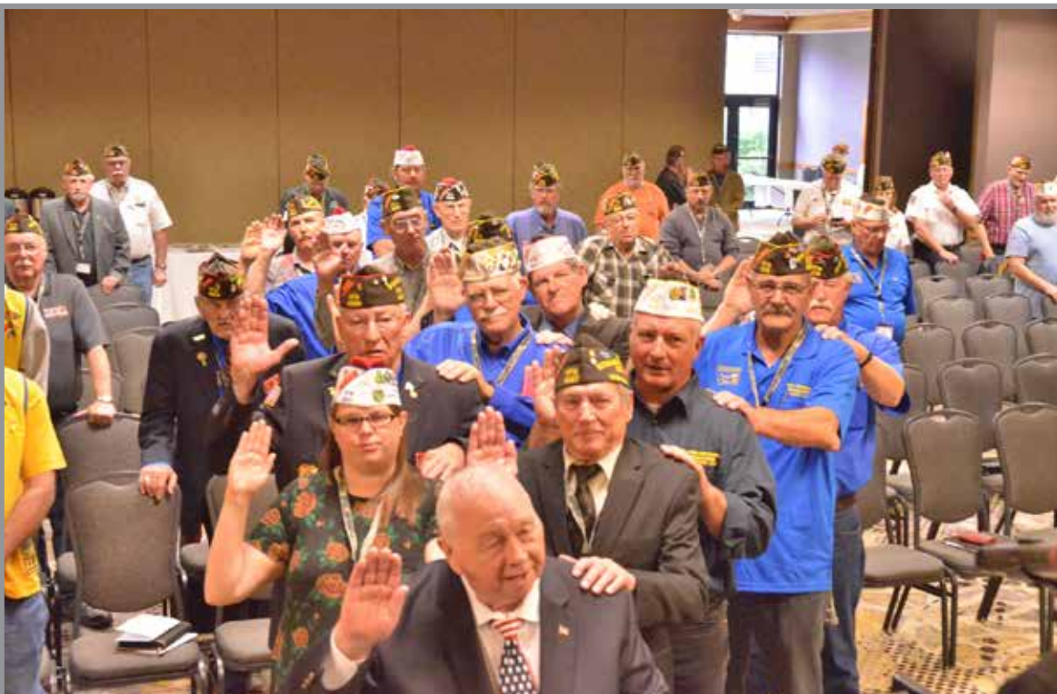
Officers-elect being installed as this year's leadership for the Department of Montana VFW.