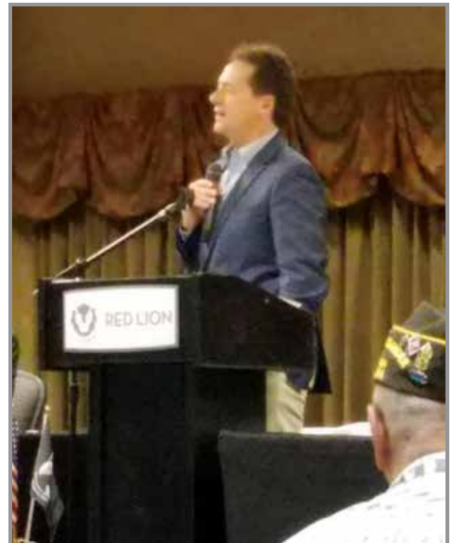
Governor Steve Bullock addressing the Convention.