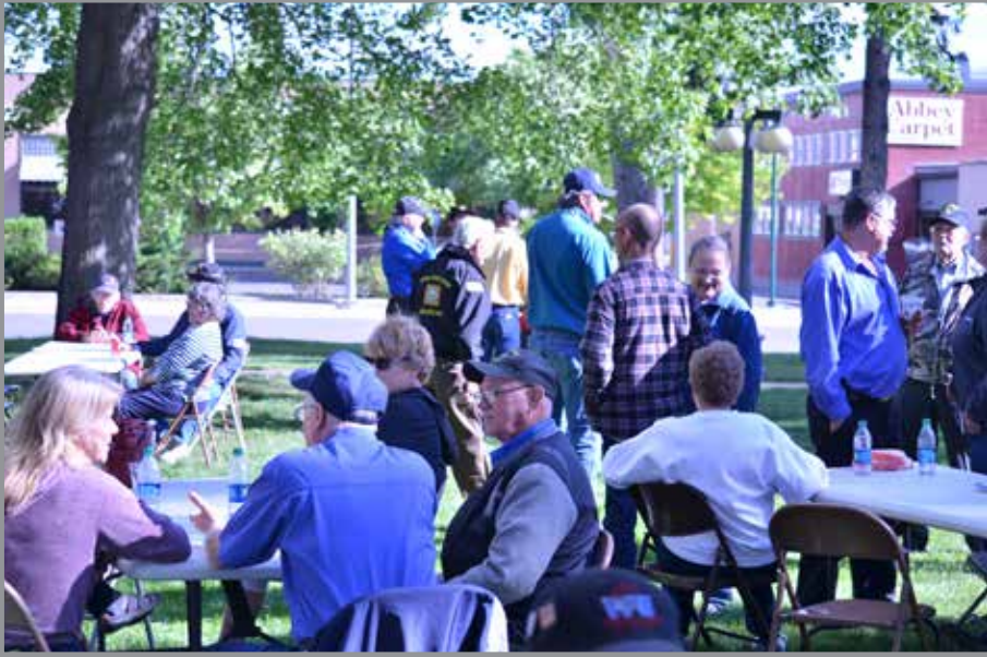
Sr. Vice Commander & President's Picnic