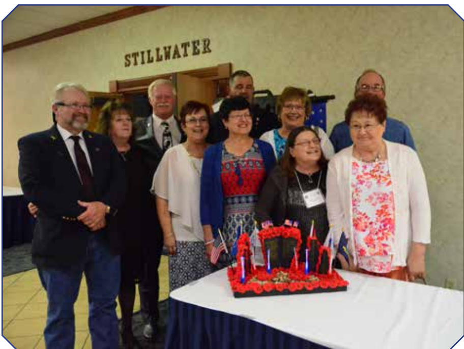
Members of Post 276 stand in front of their Poppy display.