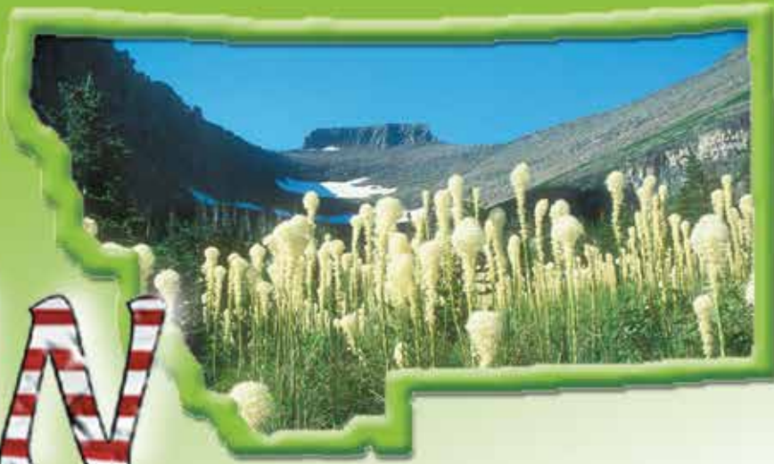
Glacier Park - Bear Grass