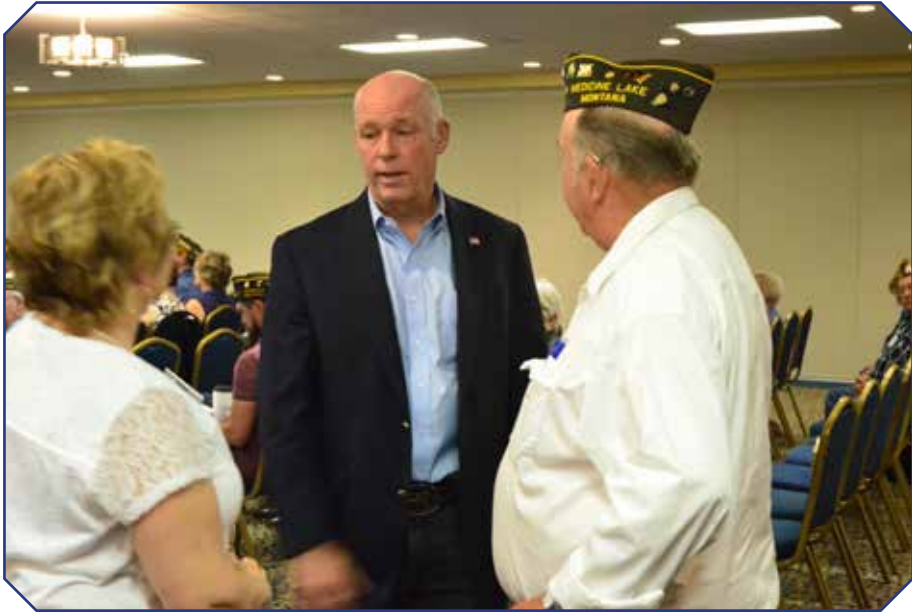
Congressman Greg Gianforte talks to the members that attended the convention.